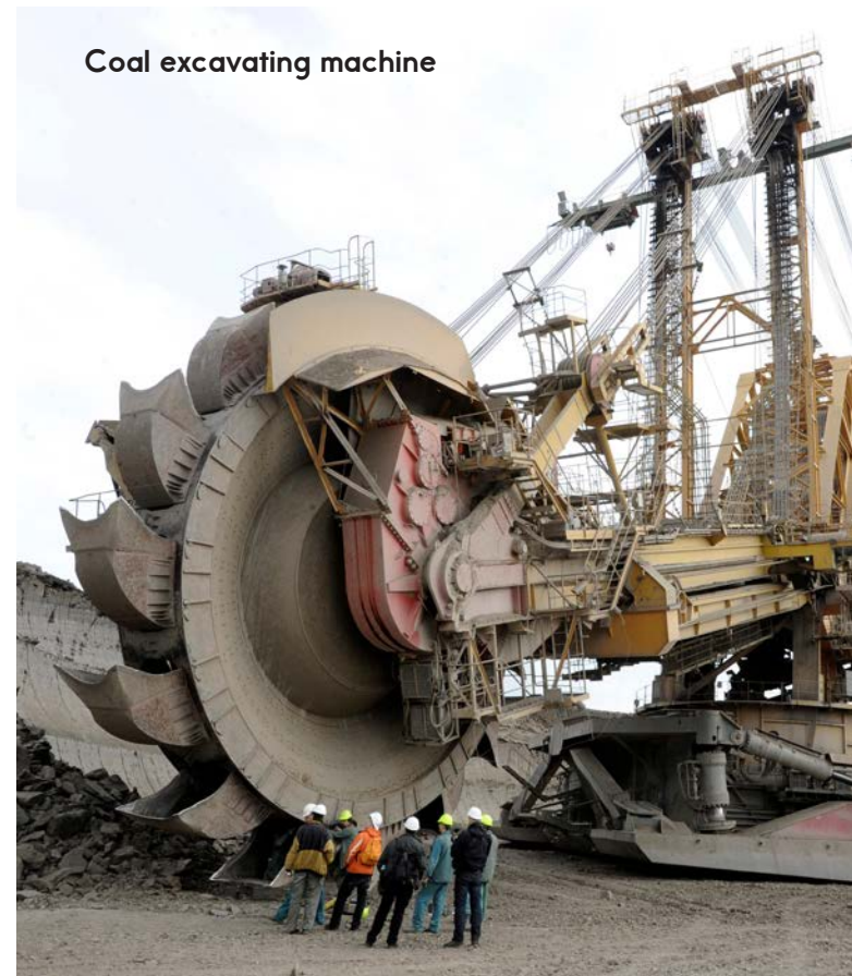
Coal excavating machine

Large drills are used to get coal out of mines. Very large excavators dig up the earth in search of resources. Huge dump trucks then carry the resources to where they can be used to make products.