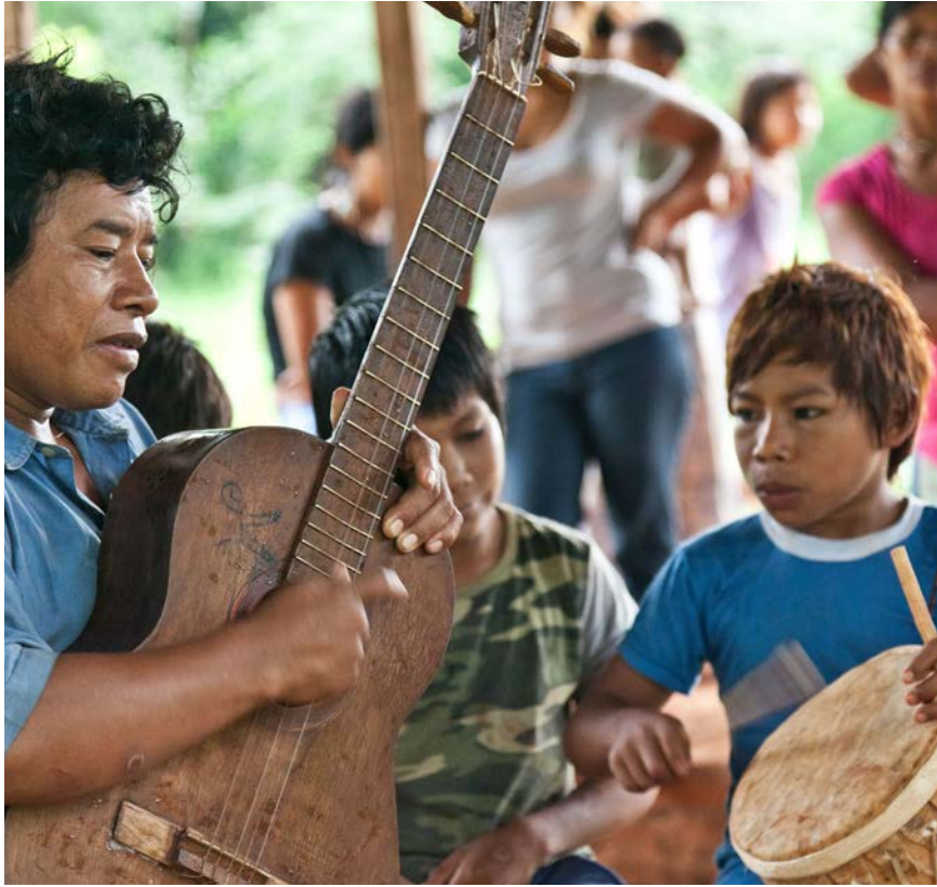
Members of the Guarani tribe play music and sing songs.

Guarani is a Native American language. It is spoken by most of the people of Paraguay. Over seven million people in the world speak Guarani.