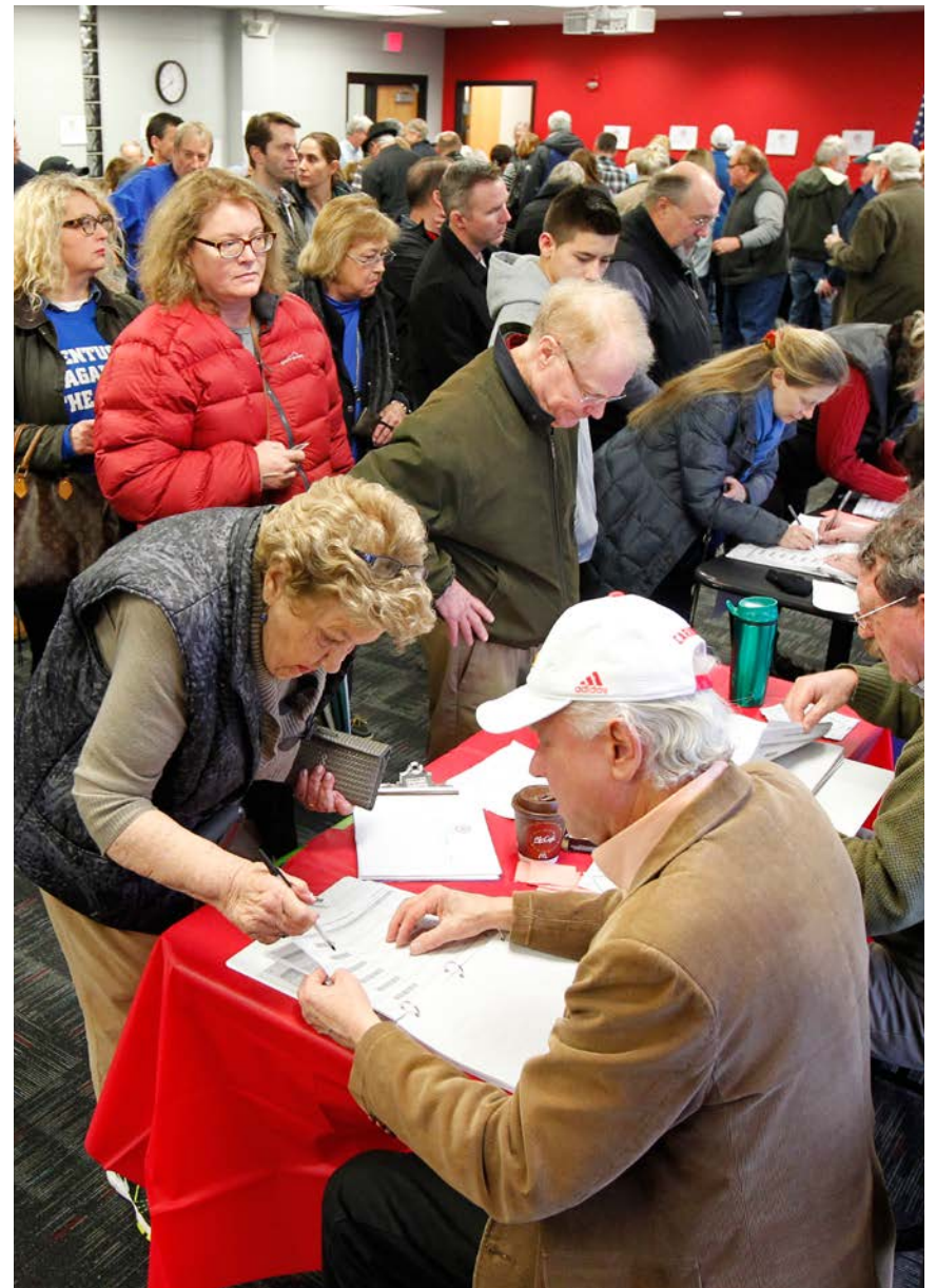
People check in to vote on Election Day.