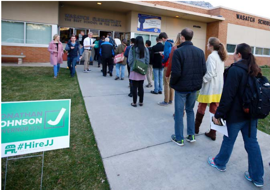
People wait in line to vote on Election Day.