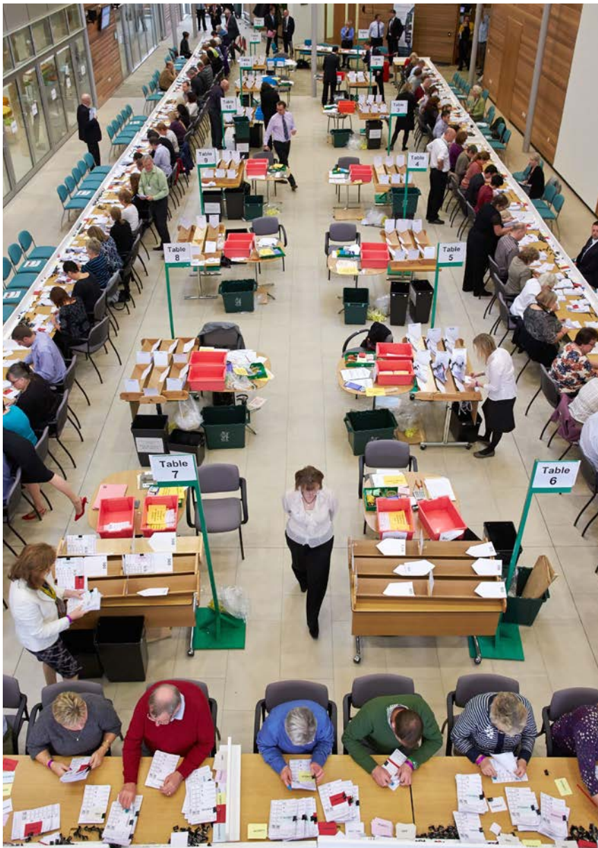
People count the votes on Election Day.