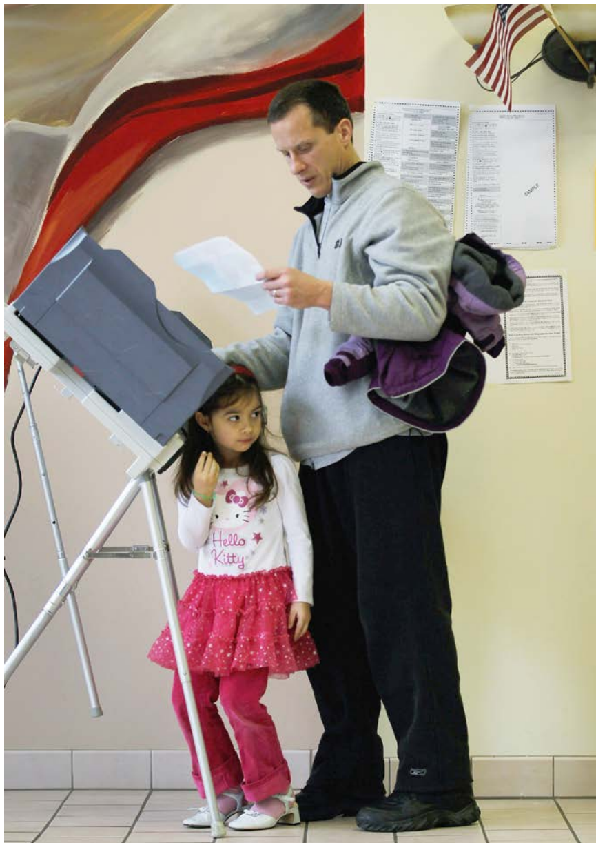
People use booths to vote on Election Day.