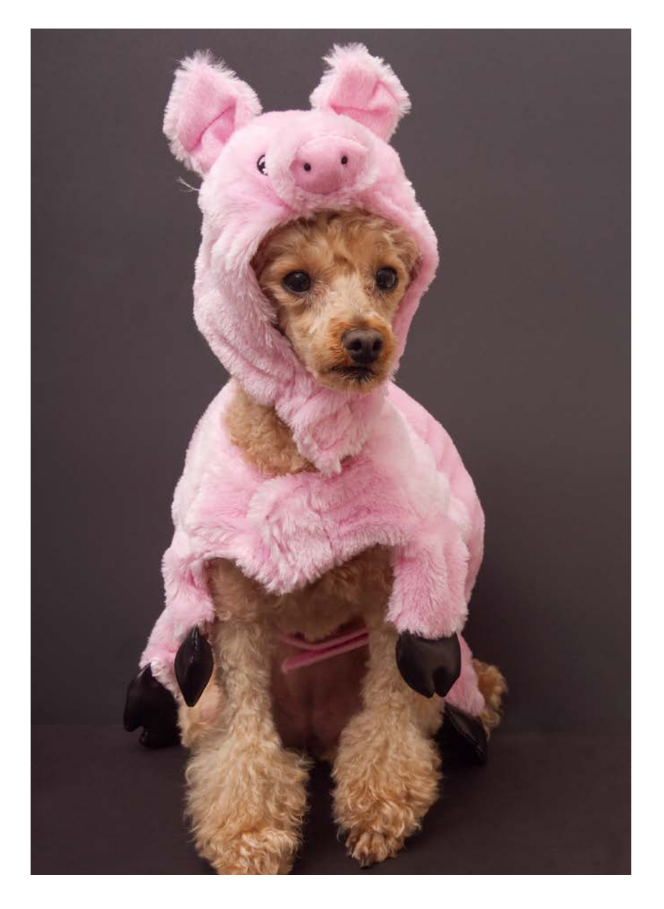
A dog can wear the snout of a pig.