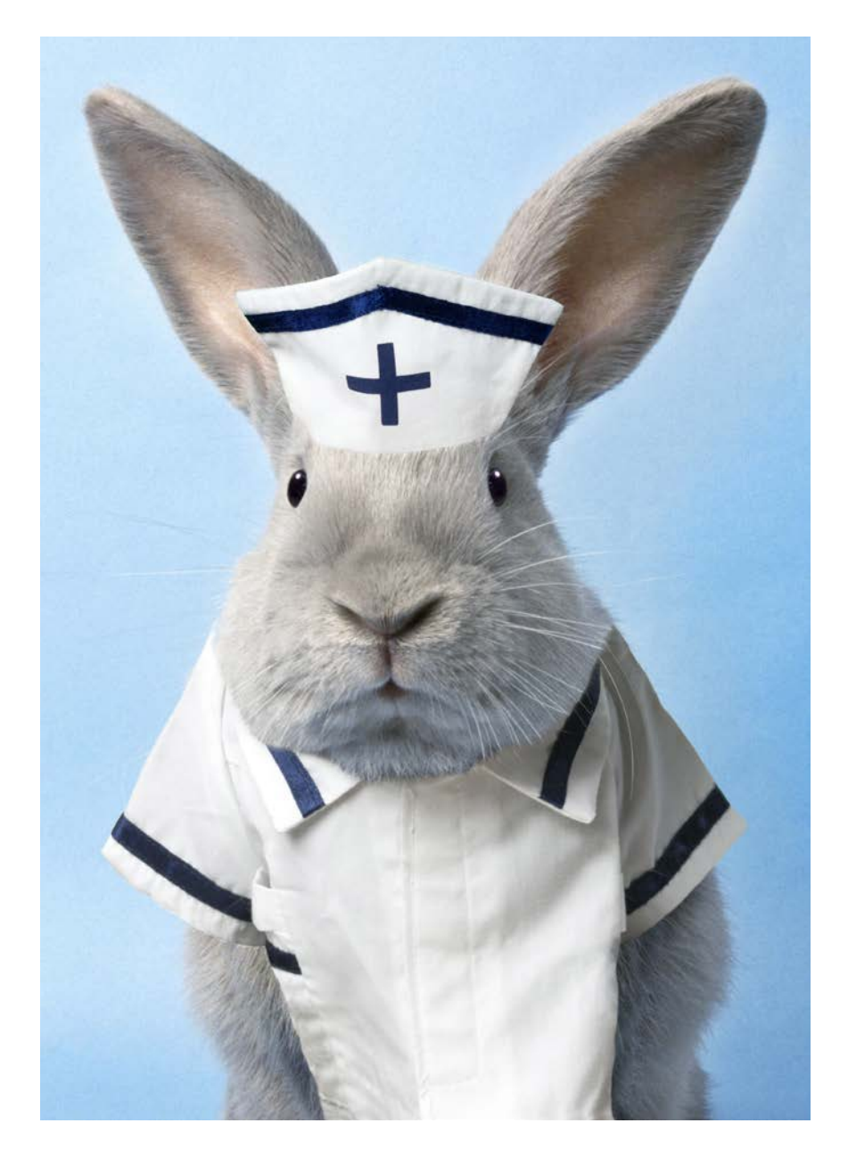
A rabbit can wear the hat of a nurse.