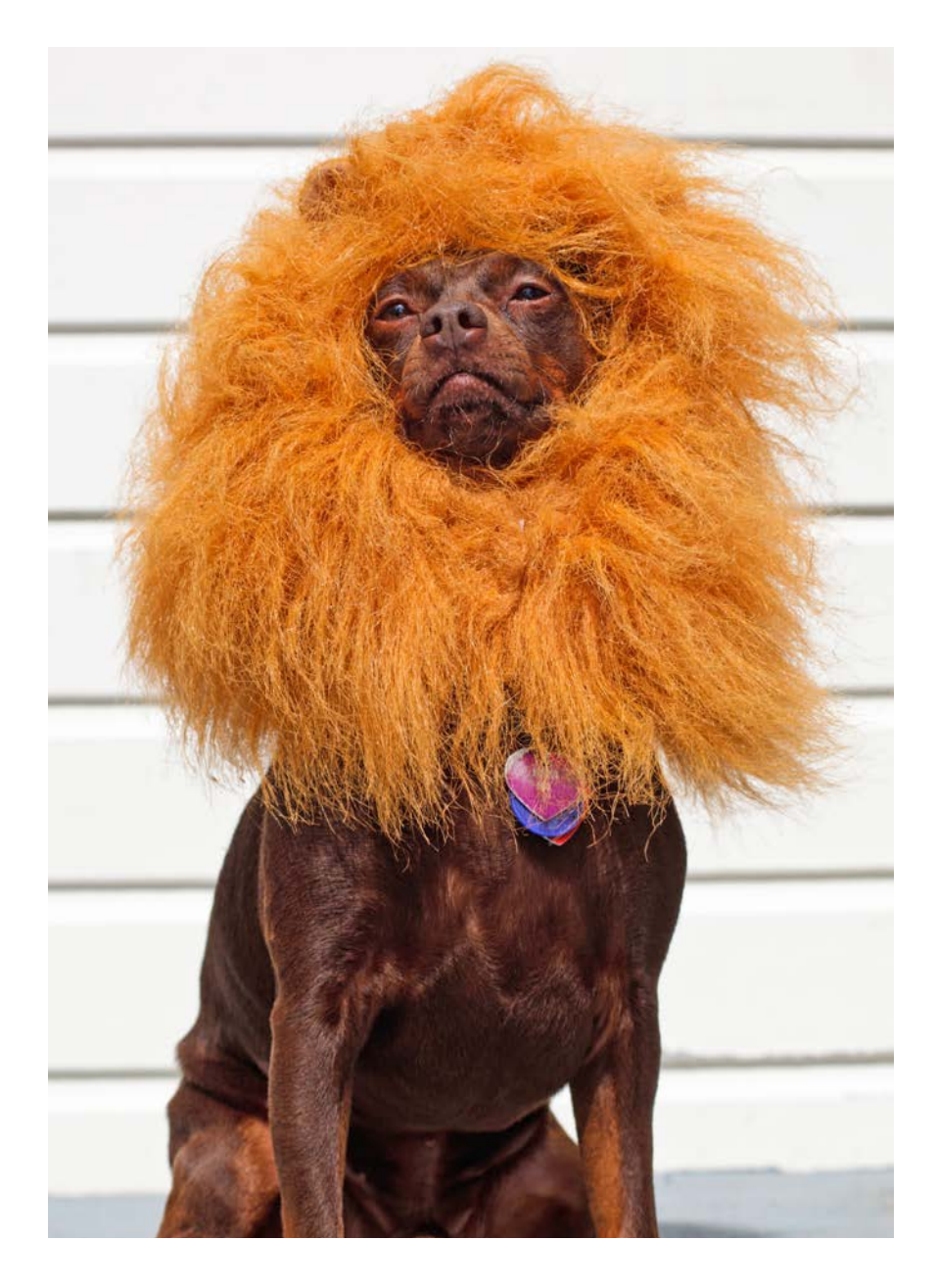
A dog can wear the mane of a lion.