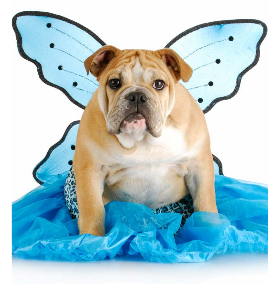
People wear costumes. Animals can wear costumes too.

A dog can wear the wings of a butterfly.