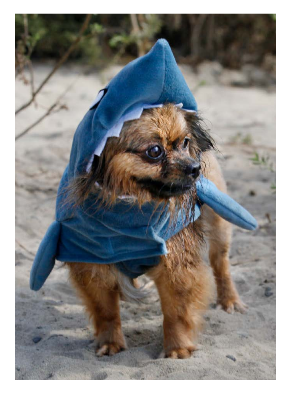
A dog can wear the fins of a shark.