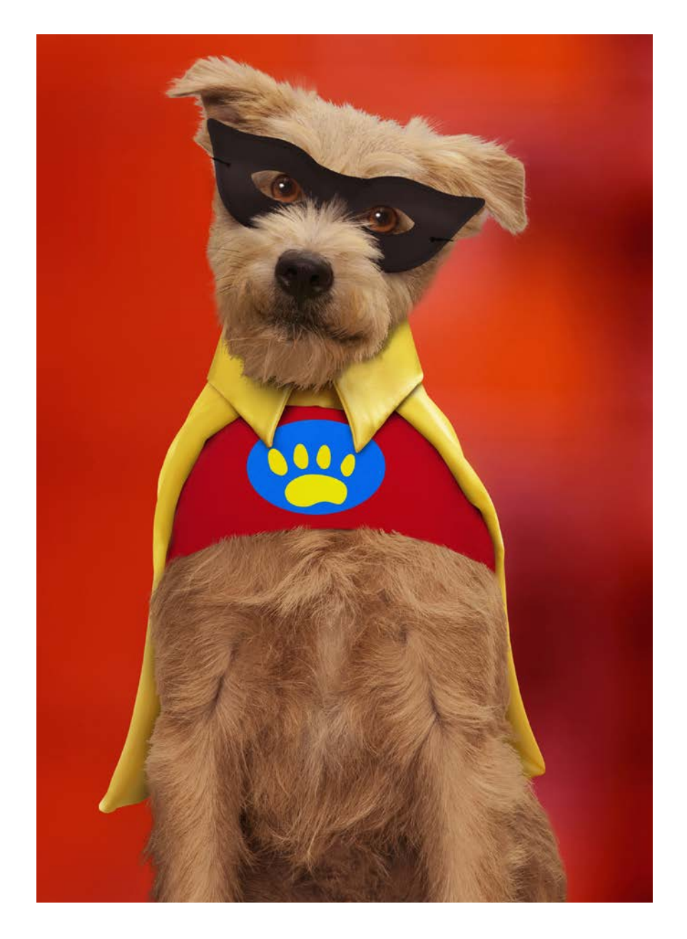
A dog can wear the mask of a superhero.