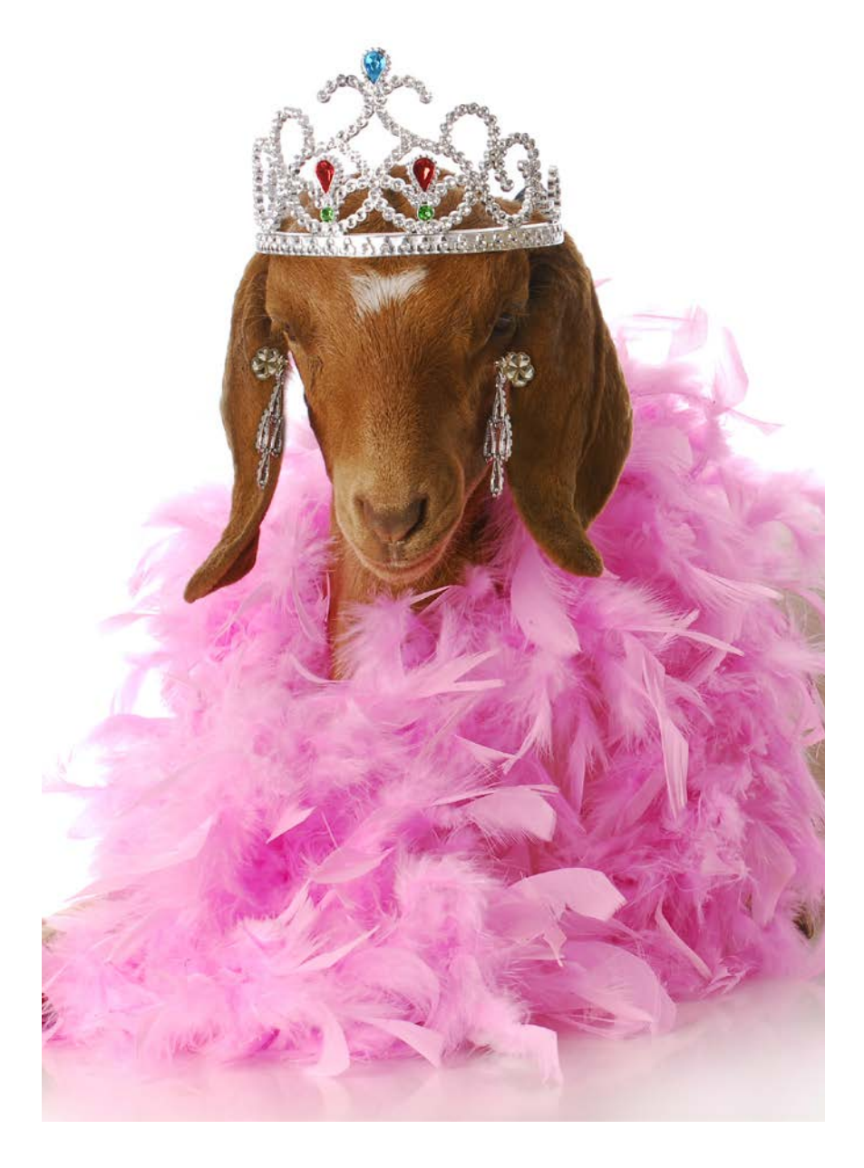
A goat can wear the crown of a princess.