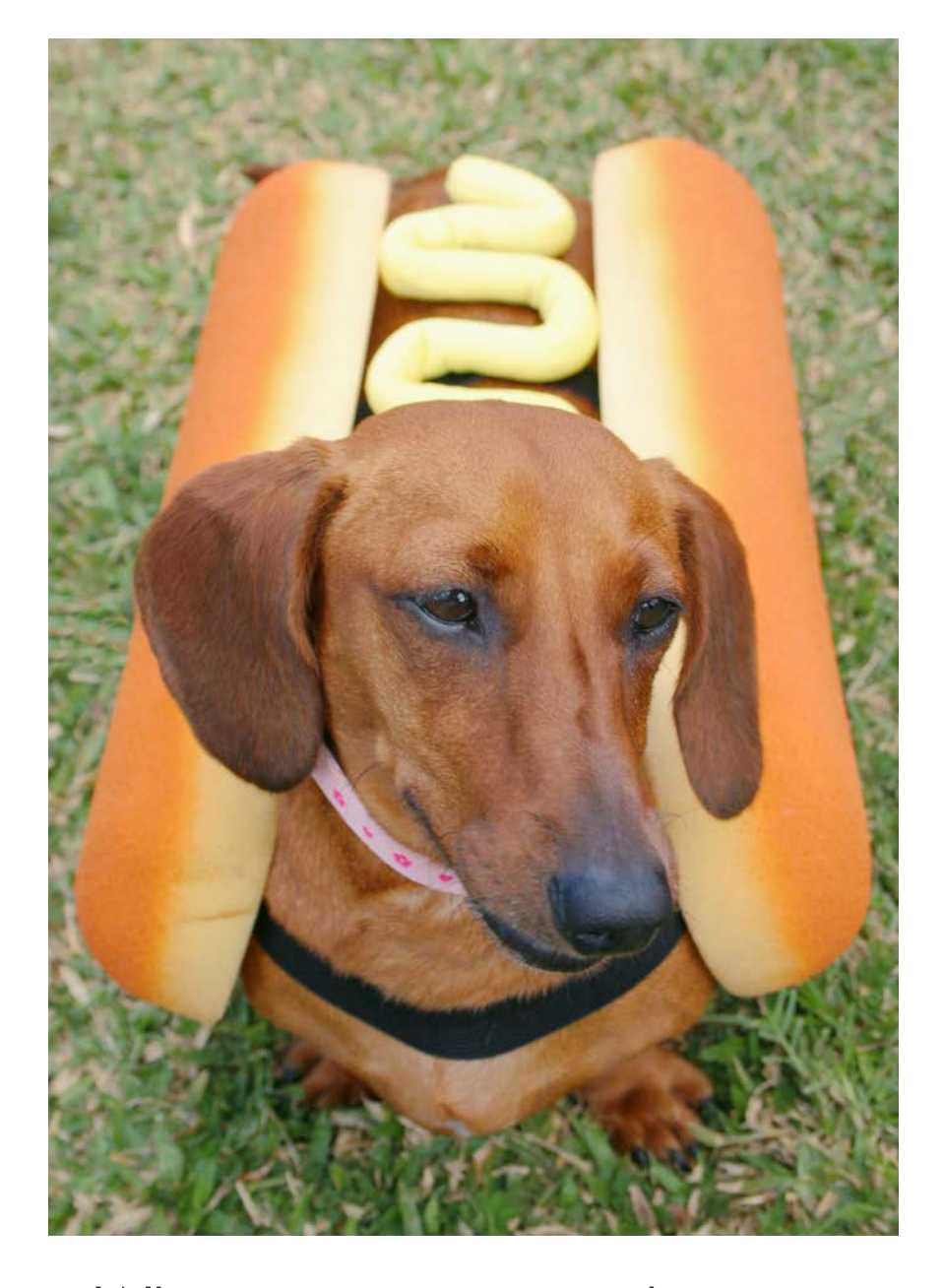
What costume is this dog wearing?